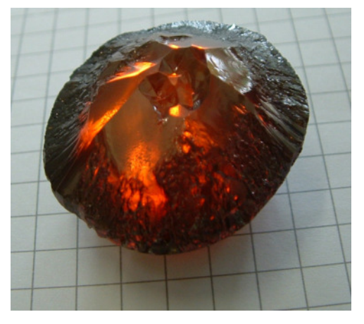
Fig. 1: AlN crystal with rhombohedral facets as well as pyramidal depressions in the center area (on 5 mm grid).

Crystals grown under relatively high radial gradients on (0001) seeds will eventually develop into a single six-fold prism ending with a pyramid with rhombohedral facets, see Fig. 1. As all facets are symmetrical to the thermal field, crystals with homogeneous properties and low defect density can be obtained. However, extended structural defects originating in the seed or at the seed interface may lead to an 'unfinished habit' featuring pyramidal depressions. As a result, growth takes place on alternating (0001) and \{01\underline{1}n\} facets, resulting in complex zonar and defect structures, see Fig. 2. If crystals are grown on seeds with appropriate off-orientation, a single rhombohedral facet will form in the main crystal area, leading to homogeneous impurity incorporation in the whole single-crystal area. But due to its low symmetry and position in the thermal field, the facet tends to bend and break up into domains and low-angle grain boundaries. Finally, possible routes to enlarge the (0001) facet will be discussed, potentially leading to AlN bulk crystals with clearly different impurity content and optical properties.